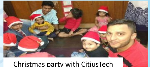
Christmas party with CitiusTech