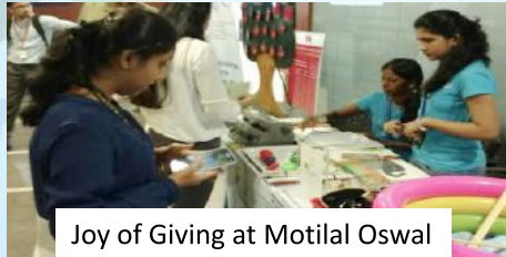
Joy of Giving at Motilal Oswal