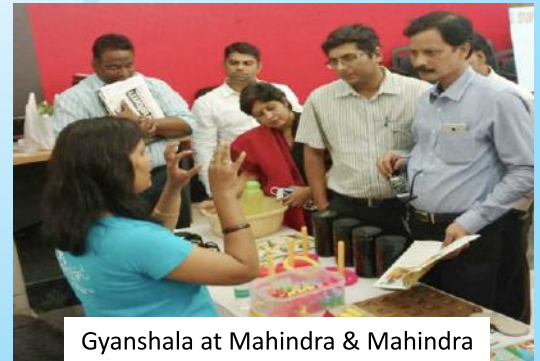
Gyanshala at Mahindra & Mahindra