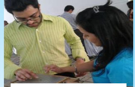
Joy of Giving at Sanofi India Ltd.