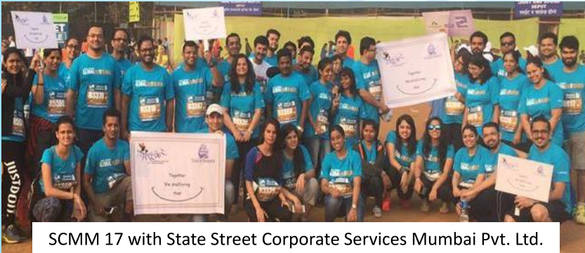
SCMM 17 with State Street Corporate Services Mumbai Pvt. Ltd.