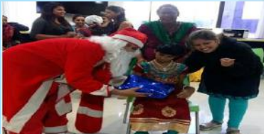
Christmas party with Travel Guru