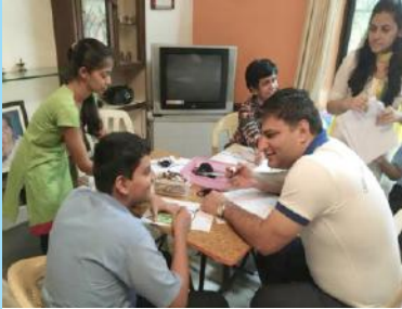
Employee Engagement Program with Johnson & Johnson and State Street Corporate Services Mumbai Pvt. Ltd.