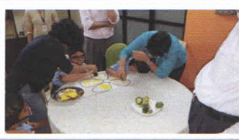
Employee Engagement Program with Johnson & Johnson