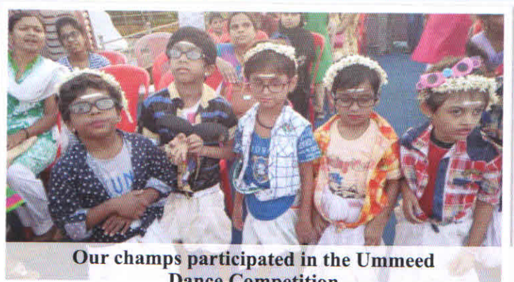
Our champs participated in the Ummeed Dance Competition