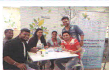
Bake Sale at State Street Corporate Services