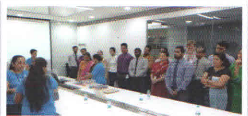
Helen Keller Day at CMA – CGM