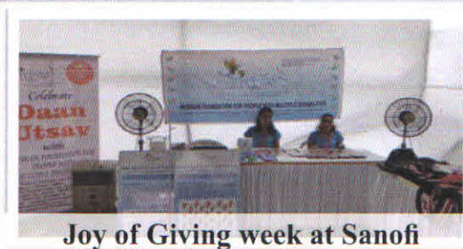
Joy of Giving week at Sanofi