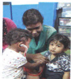
Pretend & Play Activity during a Mother Toddler Class